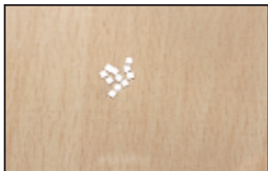
TYPICAL CHIP THERMISTOR