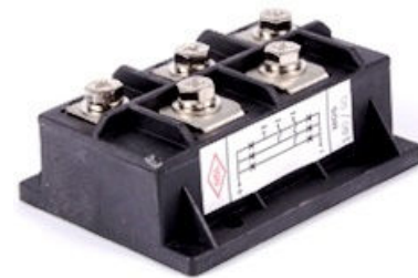
MDS - 160