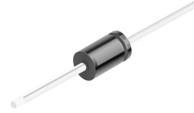
AXIAL LEAD (DO-35) CASE 017AG (Color Band Denotes Cathode)