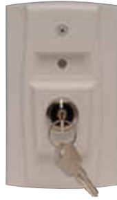
RTS151KEY UL S2522