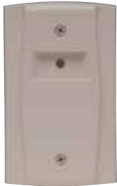
RA100Z UL S2522