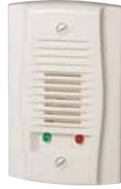
APA151 UL S4011