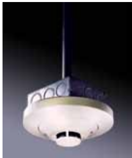
Top Mount in Ventilation Shaft