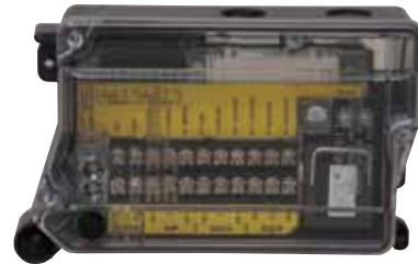
D4P120 Power Board