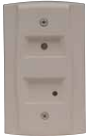
RTS151 UL S4011

System Sensor provides system flexibility with a variety of accessories, including two remote test stations and several different means of visible and audible system annunciation. As with our duct smoke detectors, all duct smoke detector accessories are UL listed.