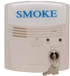
RTS2-AOS UL S2522