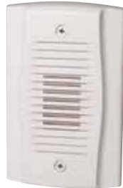
MHW UL S4011