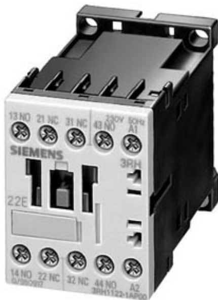
CONTACTOR RELAY, 2NO+2NC, DC 24 V, SCREW CONNECTION, SIZE S00