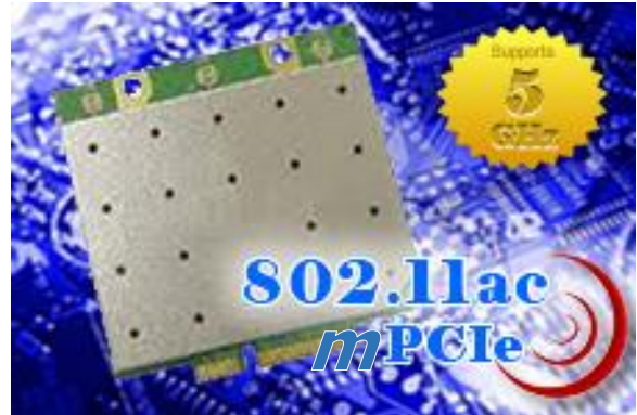
AC-920 mPCIe Module

Backed by Zcomax's quality assurance and commitment to innovation and cost effective design, this embedded module will meet and exceed the needs of your application. For more information on this or any other Zcomax product, please contact your sales representative today!