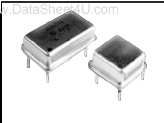
20.2 x 12.6 x 5.08 mm