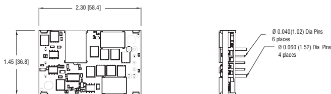
ALQ - Open Frame Series

* Astec reserves the right to make changes to the information contained herein without notice and assumes no liability as a result of its use or application. (REV03: DECEMBER 20, 2006)