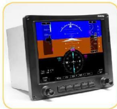
UAV Flight Control Uncertified Avionics

The ACEINNA AHRS280ZA integrates highly-reliable MEMS 6DOF inertial sensors and 3-axis magnetic sensors with extended Kalman filtering in a miniature factory-calibrated module to provide consistent performance through the extreme operating environments in a wide variety of dynamic control and navigation applications.