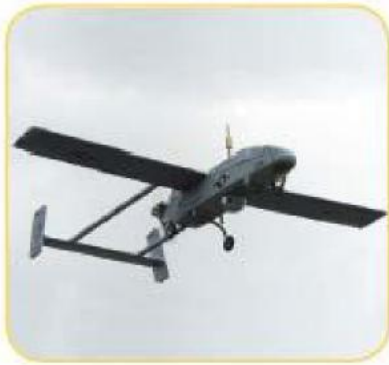
UAV Flight Control