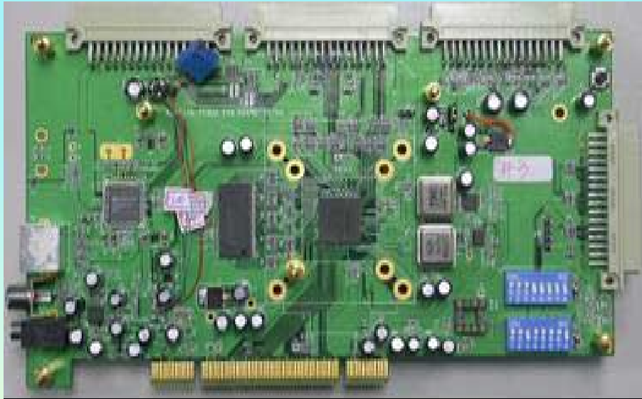
AL242 + AL9V576 PCI TV Capture EVB