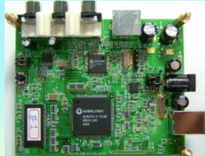
AL242 + AL9V576 USB2.0 TV Capture EVB