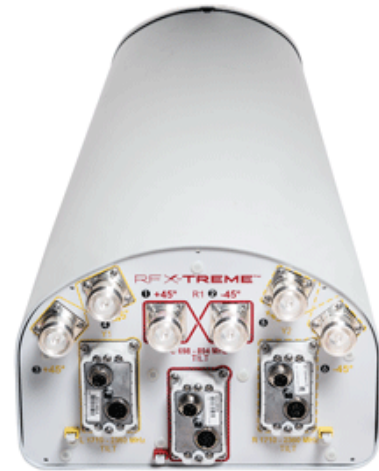
RF X-TREME FWW Series