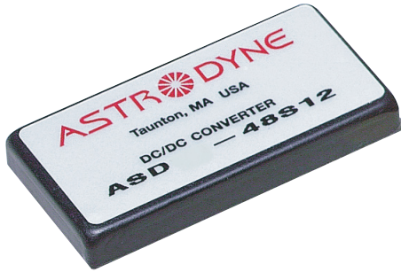
Unit measures 1"W x 2"L x 0.25"H