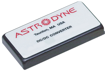
Unit measures 1"W x 2"L x 0.4"H