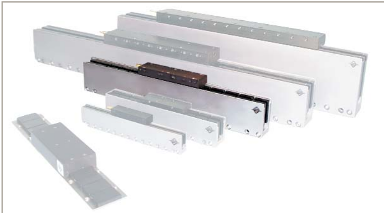
The BLM is shown with Aerotech's linear motor line.

The BLM can be driven using standard Aerotech brushless amplifiers and controllers to provide a complete integrated system.