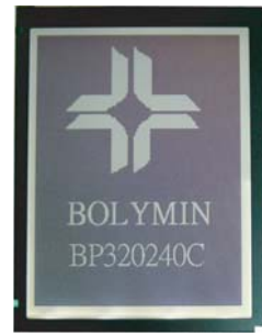
(Options : Frame without ears)