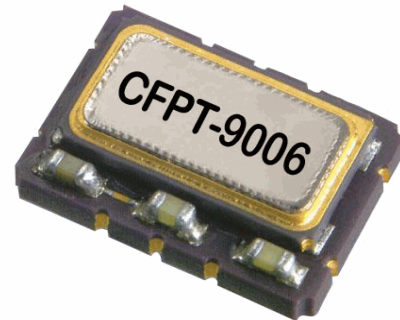
Outline (mm) -1A = No ref voltage, ageing adj option