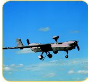
Unmanned Aerial Vehicle Control

The CRM Series remote magnetometers provide an RS-422 serial digital data bus with a Baud rate of 38,400. They are configured to operate in an auto send mode so that data is automatically and continuously transmitted following power up. Output data is transferred in a compact binary format that includes three-axis magnetic field data and built-in-test status.