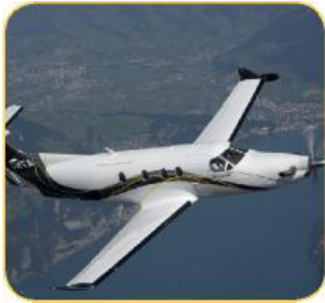
Primary Flight Display Heading Reference