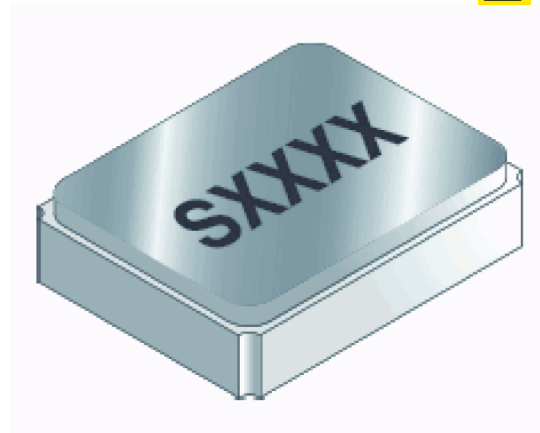
Outline (mm) SM1 = Gold Plated (RoHS)