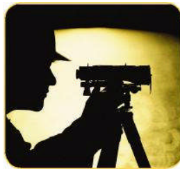
Precision Tilt Measurements

The CXTILT-Series inclinometers measure the tilt angle (roll and pitch) of an object with respect to the horizontal axis in a static environment. These high performance sensors incorporate two micro-machined low-g accelerometers, one oriented along the X-axis and one along the Y-axis.