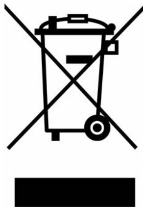
Crossed out “wheelie bin” symbol

The intent of the WEEE directive is to enforce the recycling of WEEE. A controlled recycling of end of live products will thereby avoid negative impacts on the environment.