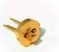
TO 5.6 mm