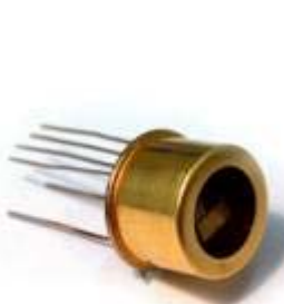
TO 8 with integrated TEC and thermistor