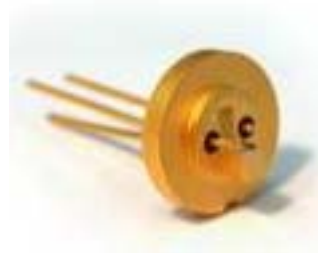
TO 9 mm