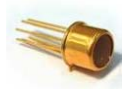
TO 5 with integrated TEC and thermistor