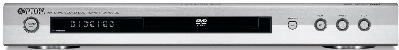
DV-SL100 Progressive Scan DVD Player

If you or anyone in your family enjoys making discs with MP3 files, you'll appreciate the DV-SL100. It provides full MP3 compatibility, including Fast Forward, Rewind and Special Playback functions, MP3 Navigation Display, playback of discs with both MP3 and JPEG files, and JPEG/MP3 Multisession compatibility