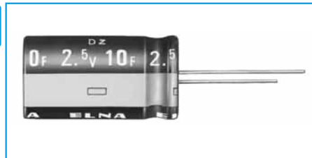
Marking color : White print on a black sleeve