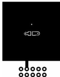
a) 80\text{ }^\circ\text{C/W} when mounted on a 1\text{ in}^2 pad of 2 oz copper