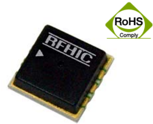
Package : CP-16B