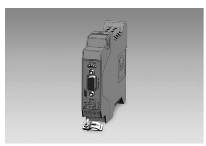
GK473 with Profibus-DP interface