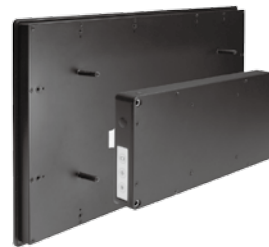
▲ Modulized design