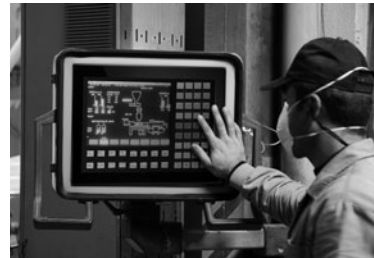
▲ Ideal for factory automation & self-service kiosk in retail