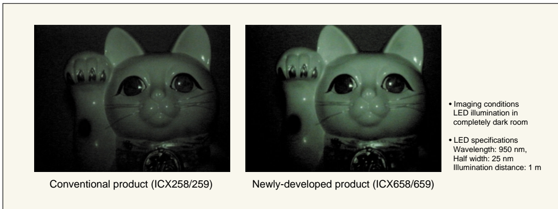
■ Photograph 1 Image Comparison