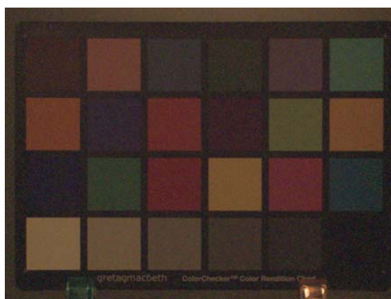
10lx, Gain Analog 18 dB, Gain Digital 6 dB