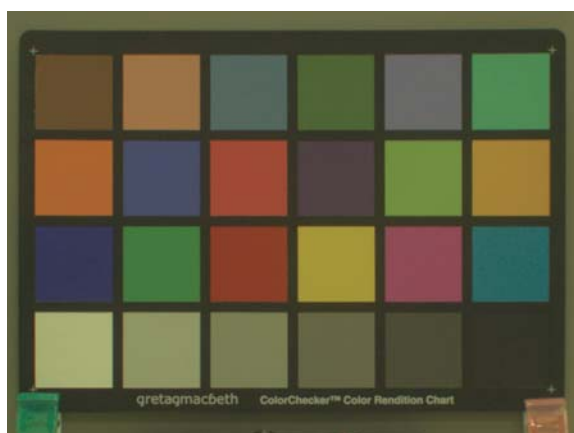
2500lx, Gain Analog 6 dB