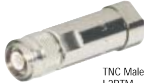
TNC Male L2PTM