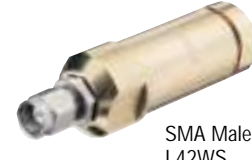
SMA Male L42WS