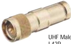
UHF Male L42P