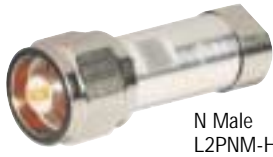
N Male L2PNM-H