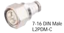
7-16 DIN Male L2PDM-C