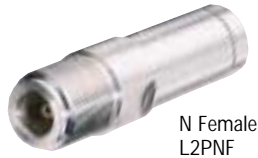
N Female L2PNF