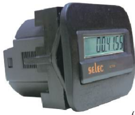
(48 x 48)