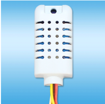
Capacitive humidity sensor -- Voltage output, Model: MM2001/MMT2001