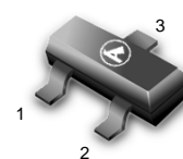
CASE 318-08, STYLE 6 SOT-23

PNP GENERAL PURPOSE DRIVER TRANSISTORS SURFACE MOUNT