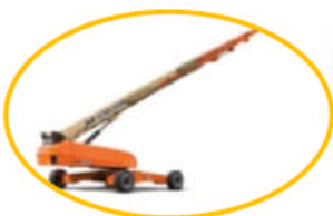
Aerial Lift Safety