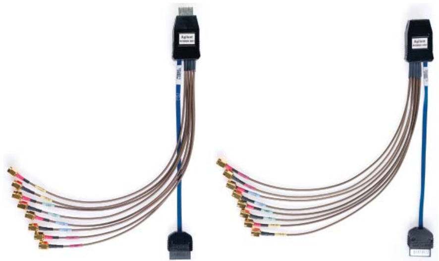
N1080A-H01 TPA with type A plug

Emerging consumer and entertainment equipment provides much higher resolution for user enjoyment. Higher resolutions demand higher communication rates, which place new demands on the source, sink and channel. The N1080A HDMI Test Point Access Adapters provide unrivaled convenience and performance.