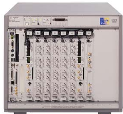
81250 modular BERT platform

* The N1080A-H03 has a socket for an EDID memory but not the actual chip itself.