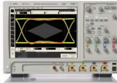
Infiniium DSO90000 oscilloscope

When these TPA's are paired with Agilent's DSO90000 Infiniium oscilloscopes and the N5399A HDMI Compliance Test Software, the user will have uncompromised accuracy and unrivaled simplicity in characterizing their source design. The TPA's excellent performance enables the user to clearly see nuances in the transmitted pattern and determine how to improve the performance of the source and channel.