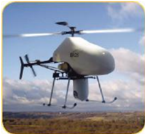
UAV Flight Control