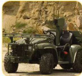
Land Vehicle Guidance

The NAV440 combines highly reliable MEMS sensors, magnetometers, and a WAAS/EGNOS-enabled GPS receiver all in a small and rugged environmentally sealed enclosure. The NAV440 provides consistent performance in challenging operating environments, and is user-configurable for a wide variety of applications.