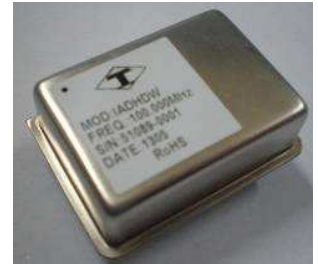
RoHS Compliant Standard

NI-100M-6900 series is a 100.000 MHz high performance (VC)OCXO offering Ultra Low Phase Noise(ULPN), low G sensitivity(LGS) and tight frequency stability down to \pm 50 ppb(-20°C to +70°C). The part comes in a small hermetically sealed through hole package which makes it suitable for humid environmental conditions.