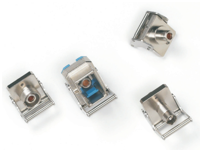
Optical adapters (BN 2150) for laser source output