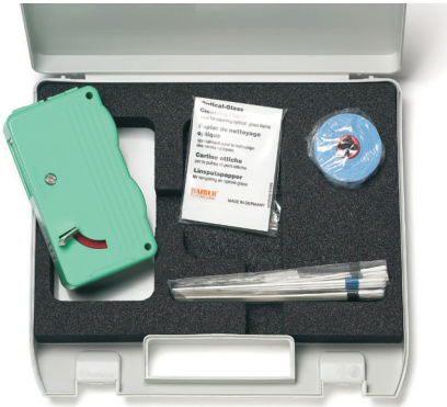
OCK-10 Optical Connector Cleaning Kit (accessory)