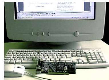
PC based image acquisition