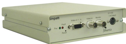
Sinpatt Video Processor