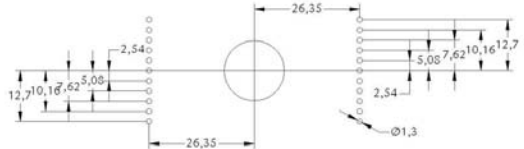
Recommended PCB layout