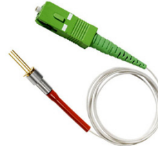
PD100-003-3xx SC/APC Pigtail