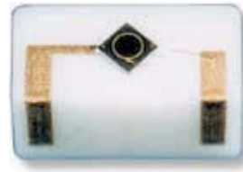
PD100-003-0xx Ceramic Sub-Mount