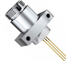
PD100-003-5xx FC Receptacle