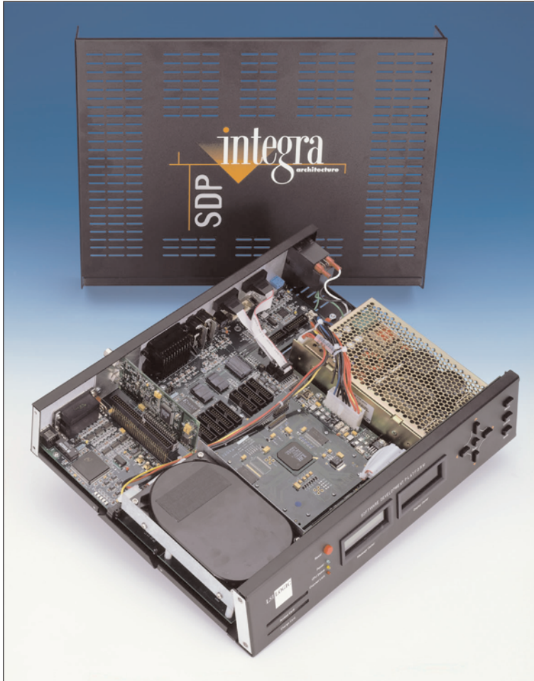
LSI Logic's Integra Set-top box Development Platform (SDP2005)