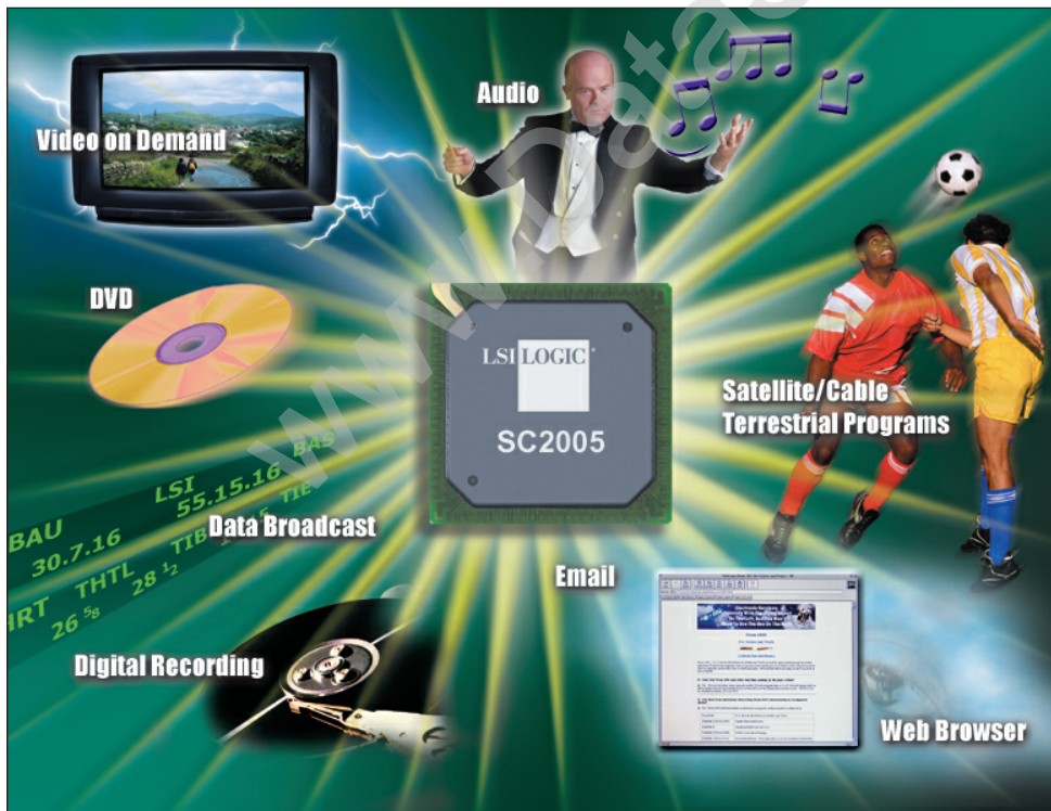
SC2005 brings performance and functionality to the next-generation consumer products

In addition to the ICAM, the SC2005 features an IDE/ATA interface allowing set-top box manufacturers to seamlessly design-in hard disk storage media for support of digital recording applications. The SC2005 chip incorporates a high performance 108-MHz, 32-bit, TinyRISC® MIPS microprocessor, making it one of the highest performing set-top box architectures on the market.