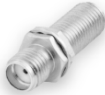
CASE STYLE: DJ952