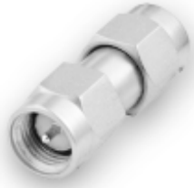
CASE STYLE: DJ951