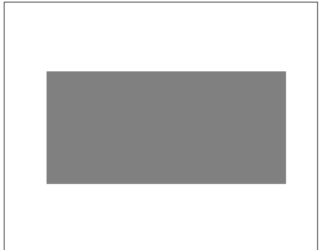
Fig.5 The SP1648 operating in the voltage-controlled mode

C_S = shunt capacitance (input plus external capacitance).