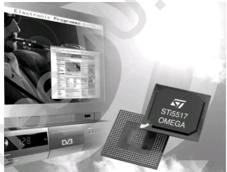
Figure 1. Package: PBGA 35 x 35 (388)