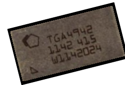
16-pin 16x8 mm SMT

The TGA4942-SL is RoHS compliant. Evaluation boards and bias boards are available upon request.