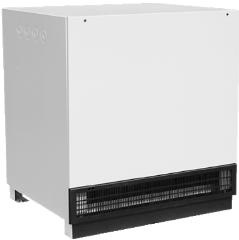
CR3 cabinet model

POWER BATTERY offers an extensive line of pre-wired and fused battery cabinets complete with UL and CUL approval. Standard and custom DC voltages complete with breakers and chargers are available.