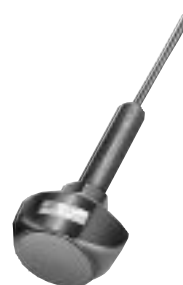
LF type (UT200LF8)