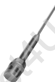
BA type (UT200BA8)